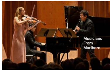
Musicians From Marlboro