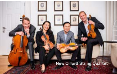
New Orford String Quartet