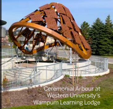
Ceremonial Arbour at Western University's Wampum Learning Lodge

Western University is located in Dish With One Spoon Treaty Territory, the ancestral territory of the Anishinaabek, Haudenosaunee, Lunaapéewak and Chonnonton Nations.