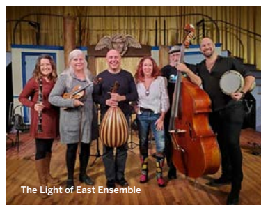
The Light of East Ensemble