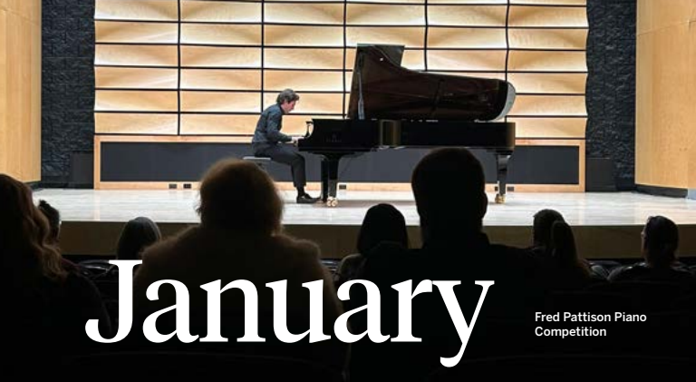
Fred Pattison Piano Competition