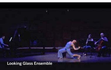
Looking Glass Ensemble