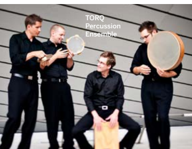
TORO Percussion Ensemble