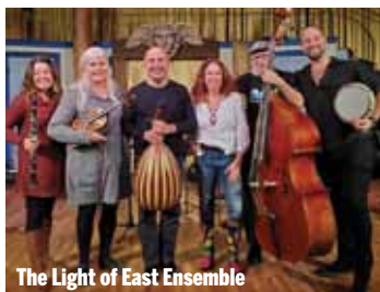
The Light of East Ensemble