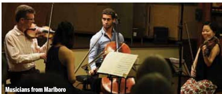
Musicians from Marlboro