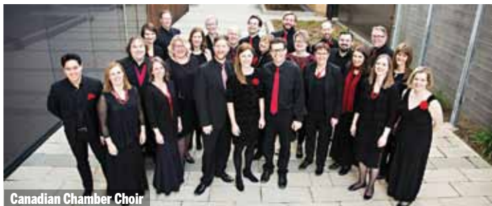
Canadian Chamber Choir