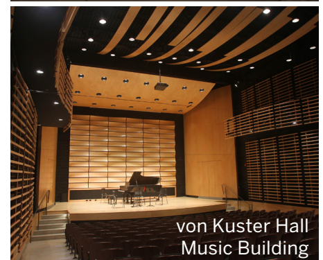
von Kuster Hall Music Building

All concerts and special events (350+ annually): music.uwo.ca/events